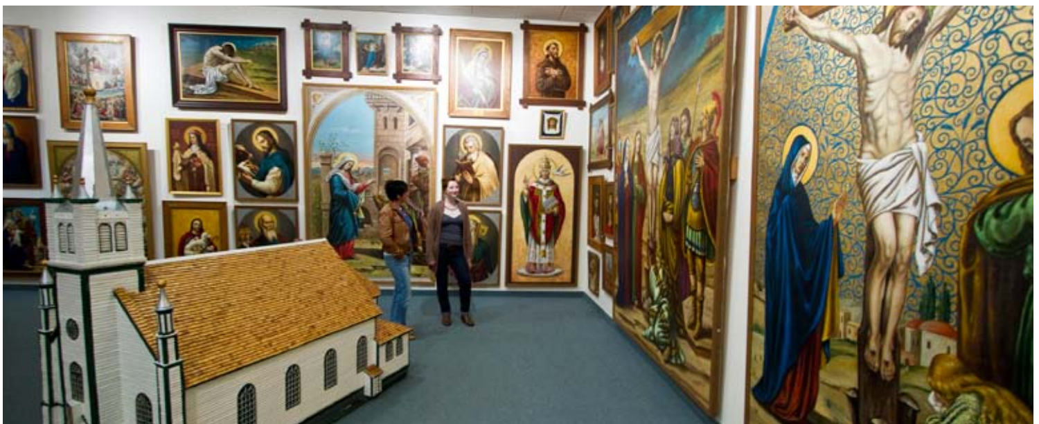
Barr Colony Heritage Cultural Centre, Lloydminster.

Return to Hwy 14 and travel 210 km back to Saskatoon where you will overnight. If time permits, break up your trip to Saskatoon with a stop at the Biggar Museum & Gallery, or call ahead for a tour of the Living Sky Winery at Perdue and pick up a bottle of Saskatchewan-grown goodness to savour later.