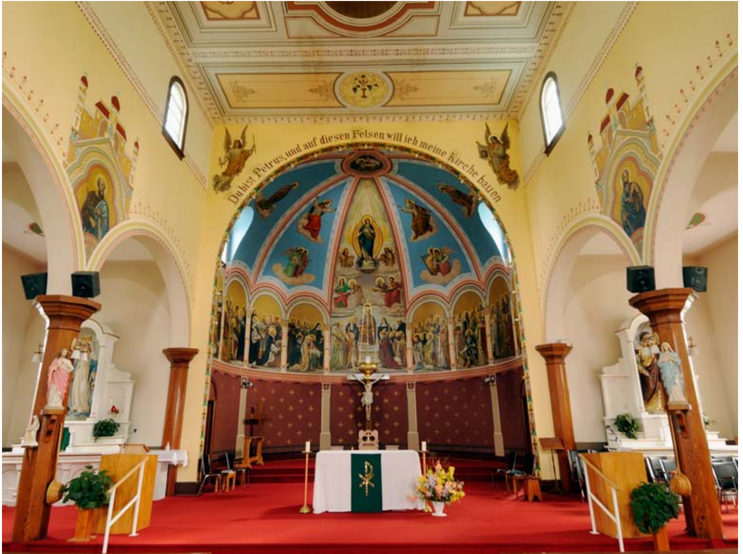
St. Peter's Cathedral, Muenster.