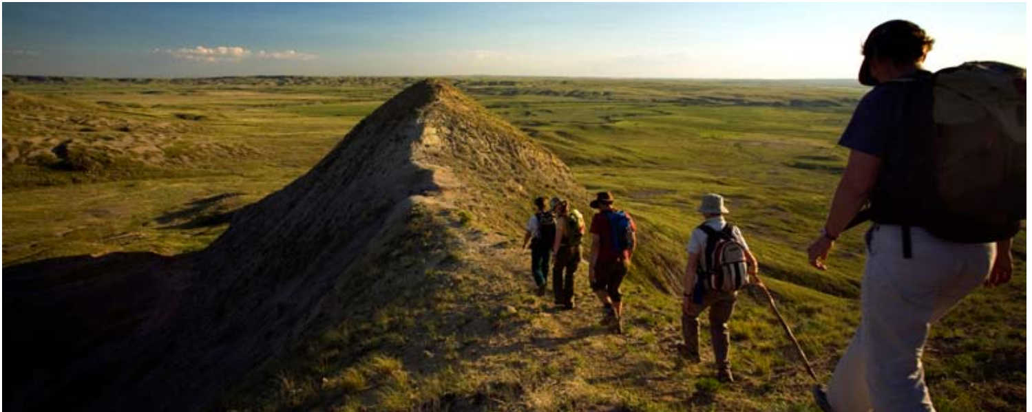
Grasslands National Park of Canada.

Driving south of Bengough you suddenly drop into the wide scenic valley. Follow the road running west along the valley floor to Big Muddy's iconic landmark – Castle Butte. The weathered slopes of this 60-metre high monolith are impressive anytime, but become magical at sunrise or sunset when bathed in the sun's brilliant reddish-orange glow. Castle Butte is located 22 km south of Bengough on Hwy 34 and 5 km west on a grid road. Watch for the sign at the grid turn-off.