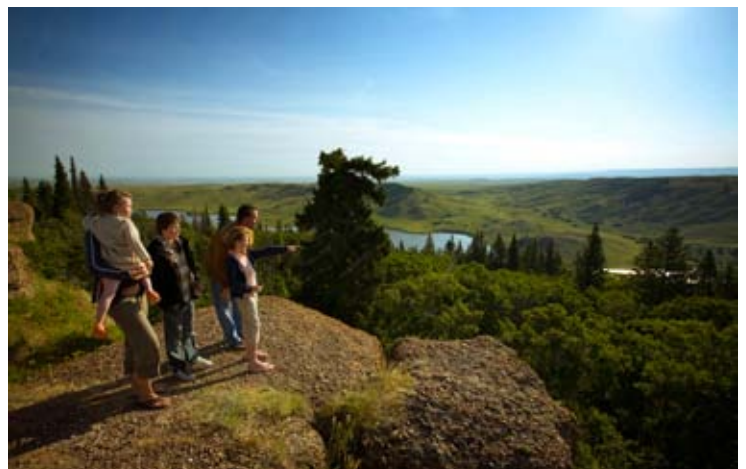
Cypress Hills Interprovincial Park.

To finish your route, return to Hwy 271 for the scenic 50 km drive to Maple Creek, which is just south of Trans Canada Hwy 1 and a much quicker route back to Regina. The Cypress Hills Vineyard & Winery is located just off Hwy 271 en-route to Maple Creek (watch for signs). If time allows, cap off your visit to Saskatchewan's southwest with a tasting of their wines made from Saskatchewan-grown fruits, a slice of saskatoon pie and a gourmet sandwich or artisan cheese platter.