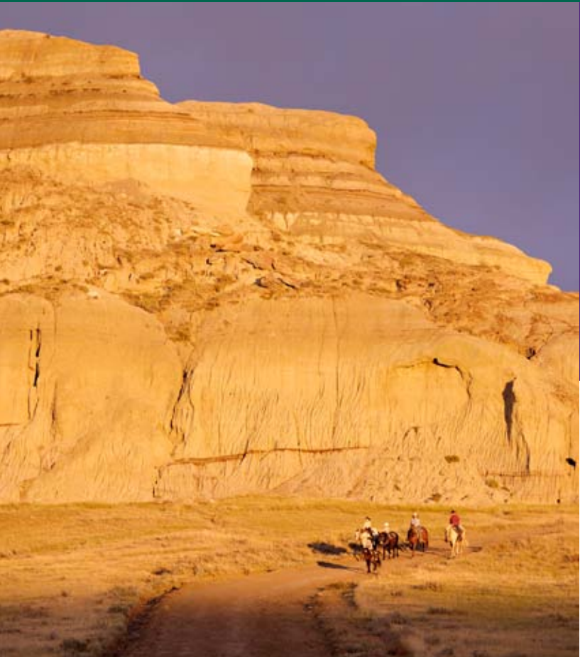
Castle Butte, Big Muddy Badlands.

Saskatchewan’s southwest is a land of larger than life landscapes – bison roaming sweeping grasslands, wild badlands, picture-perfect valleys and some of Canada’s highest land between the Rockies and Labrador.